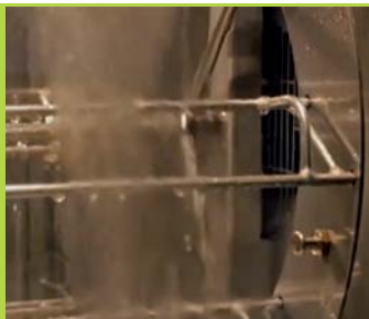
Full-automatic cleaning system

Contact us for approved detergents that are suitable for cleaning the ACR