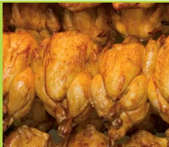
Delicious juicy products