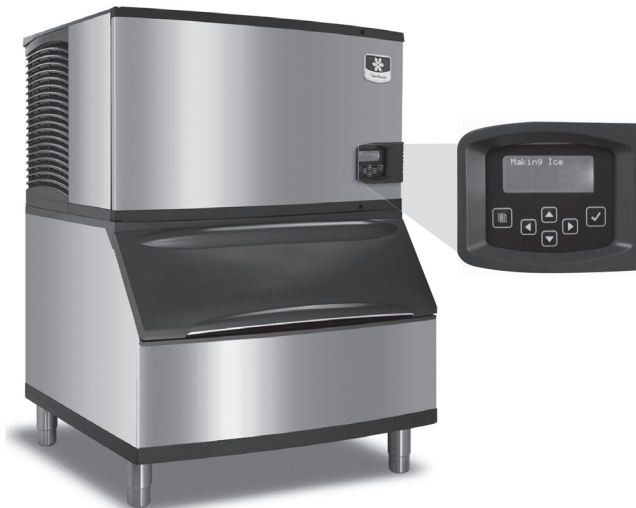
Indigo Series i-300 Ice Machine on B-170 Bin

Designed for operators who know that ice is critical to their business, the Indigo™ Series ice machine's preventative diagnostics continually monitor itself for reliable ice production. Improvements in cleanability and programmability make your ice machine easy to own and less expensive to operate.