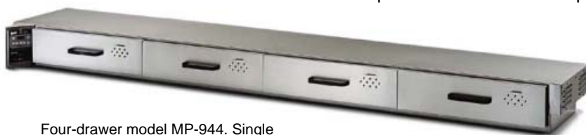
Four-drawer model MP-944. Single drawer units can be combined into two, three or four-drawer units.