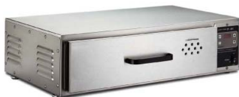
Modular countertop heated holding cabinet, model MP-941 with single drawer and slide vent humidity control.

MODEL MP-941 single-drawer MP-942 two-drawer MP-943 three-drawer MP-944 four-drawer