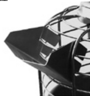
Hobart Ingredient Chute

Listed by Underwriters Laboratories Inc. and certified by NSF International.