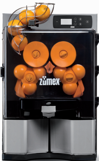
Zumex Essential Silver