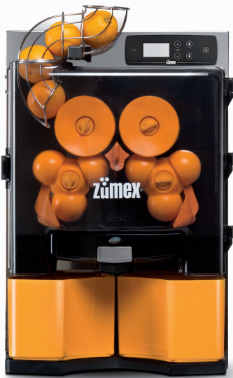
Zumex Essential Orange

The designs and specifications of the products in this catalogue can be modified without prior notice.