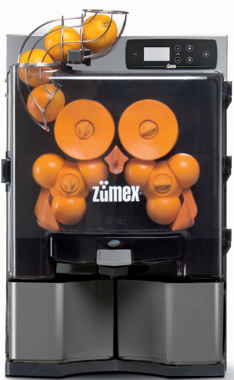
Zumex Essential Graphite